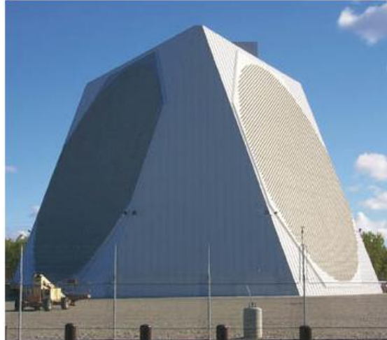
Fig. 3: PAVE PAWS phased array at Clear AFS, Alaska