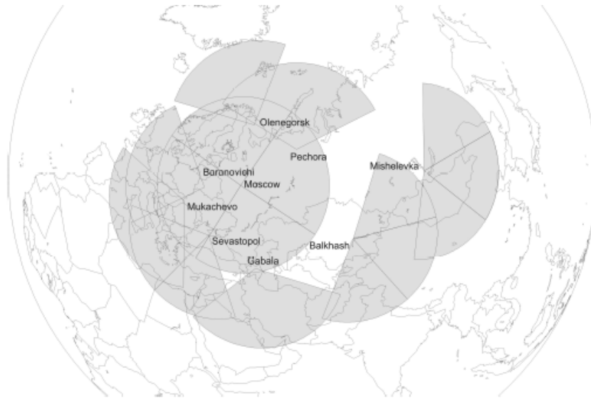
Fig. 4: Russian early warning radars [12]

Balkhash (Kazakhstan), and Mishelevka. Fig. 4 shows the location and coverage of the Russian early warning radar network.