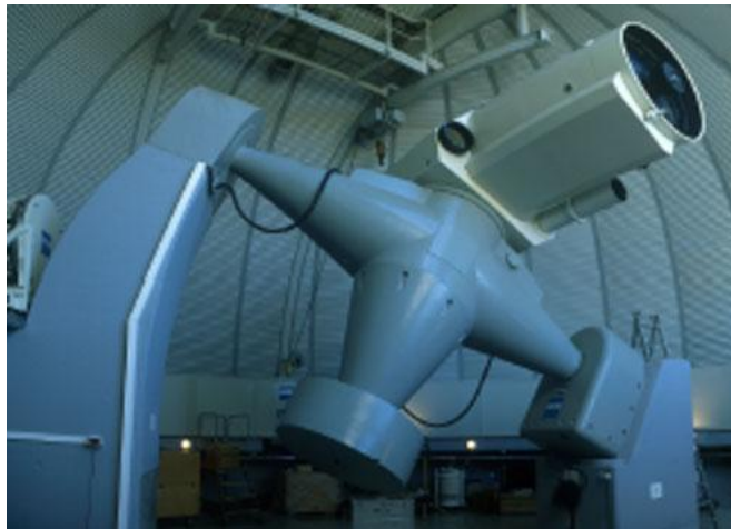
Fig. 5: ESA Space Debris Telescope, Tenerife, Spain [14]

Optical telescopes form the second major type of sensor used to track space objects. They operate in the same fashion as telescopes used for astronomy applications: electromagnetic radiation emitted by an object is gathered and focused to form an image. Refracting telescopes use lenses, while reflecting telescopes use mirrors. Catadioptric telescopes used a combination of mirrors and lenses. Although telescopes can be designed for many different parts of the EM spectrum, the visible portion is most often used for SSA. Fig. 5 shows the European Space Agency's (ESA) Space Debris Telescope, located on the island of Tenerife, Spain.