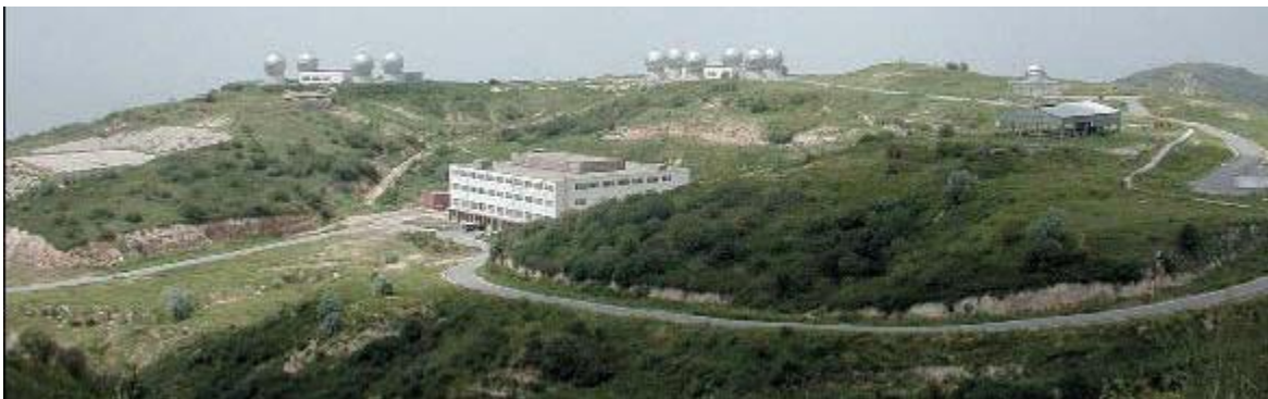
Fig. 6: Russian Okno facility[21]

The Russian military operates a significant optical tracking facility in northern Tajikistan. Known as Okno or "window", the facility includes a number of optical telescopes that can track objects in all orbital regimes, including LEO. The Okno facility provides the Russian military with coverage of the GEO belt over Russia only.